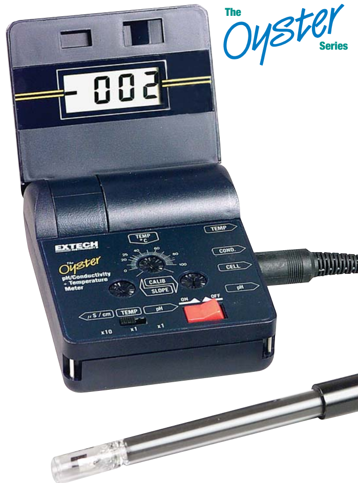
Adjustable "Flip-up" display