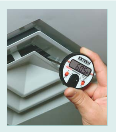
Stem thermometer ideal for measuring temperature in HVAC applications such as air ducts, vents, and heaters.