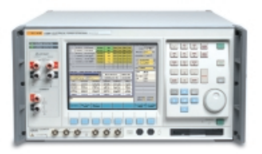
6100A/E Electrical Power Standard