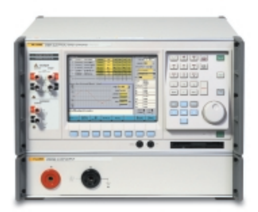
6100A/80A Electrical Power Standard