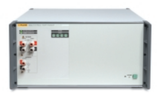
6101A Auxiliary Power Standard