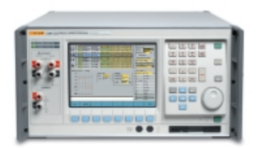
6100A Electrical Power Standard