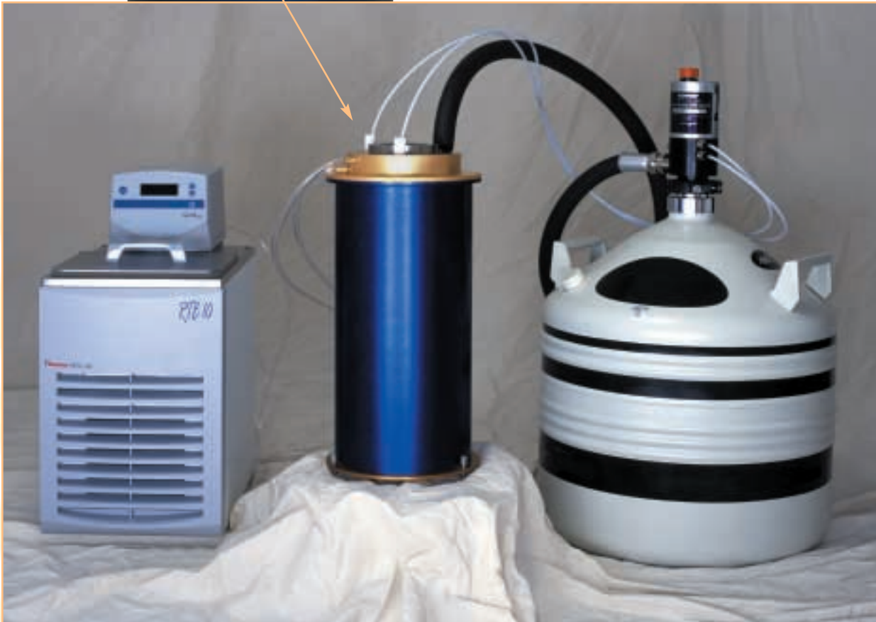
Primary Waveguide Noise Standards