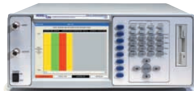
Noise temperature and accuracy is displayed on controller