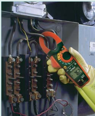
True RMS Clamp meter gives you accurate readings of non-sinusoidal waveforms