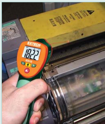
Electrical Troubleshooting for hot spot detection