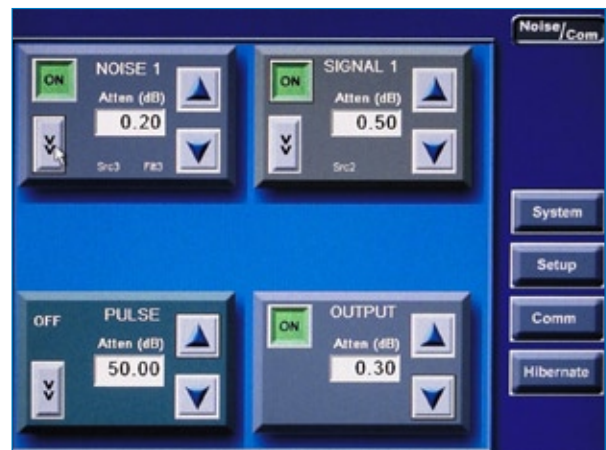
Intuitive standard control menu